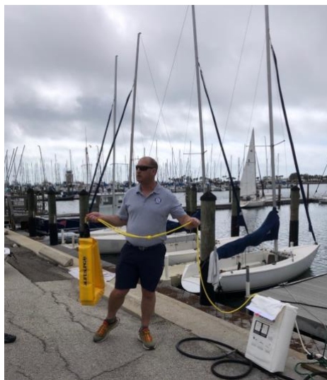
Figure 6: Deploying a LifeSling.