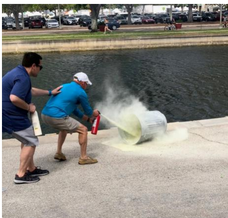
Figure 5: Fire extinguisher with back-up.