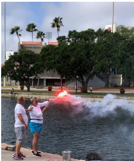
Figure 4: Flare training.