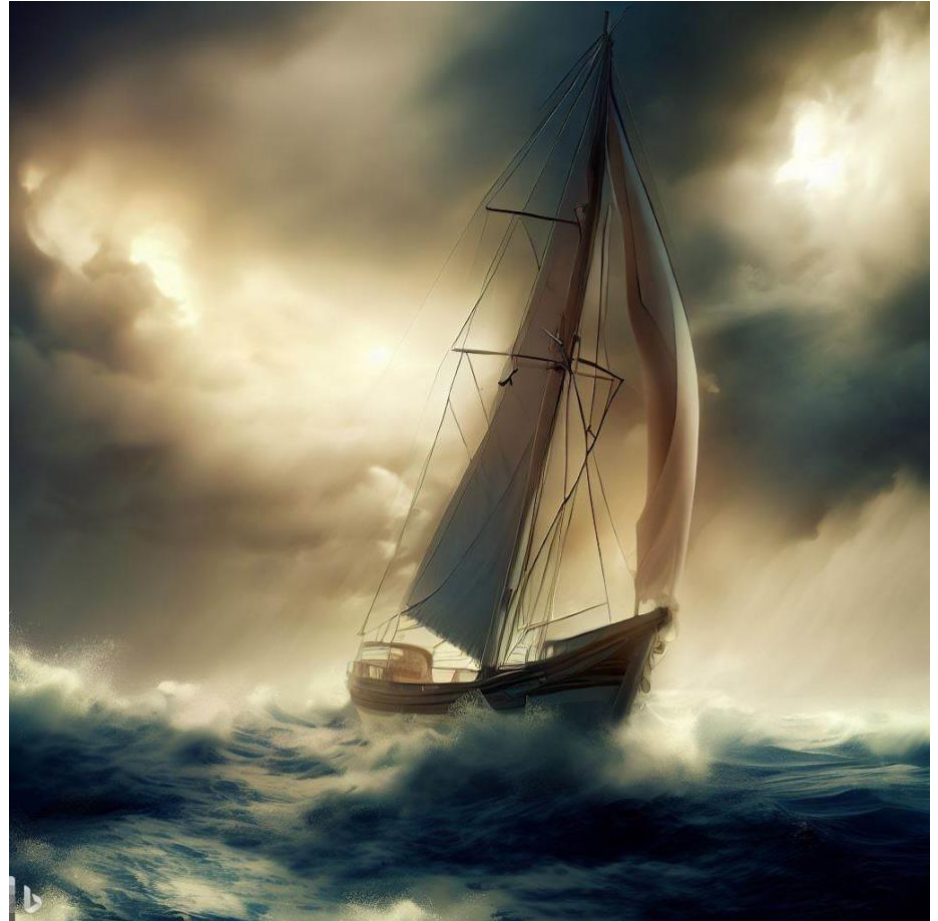
Figure 3: A sailboat in a stormy sea. Drawing by Image Creator, an AI program for generating artwork.

I recently completed the International Offshore Safety at Sea Course with Hands-on Training . The classes are offered by US Sailing and required for many offshore sailboat races. Our planned Marion to Bermuda Race in 2021 was one and I began the program at that time. COVID wreaked havoc with those plans but I wanted to complete the full course when the in-person sessions were re-started. Safety@Sea consists of 15 on-line sessions followed by a one-day, hands-on training session. The first 10 sessions constitute the inland/coastal waters component and do not include in-person training. The in-