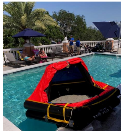
Figure 7: Six-person life raft deployed.