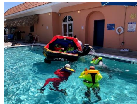
Figure 8: Student attempting to board an occupied raft.